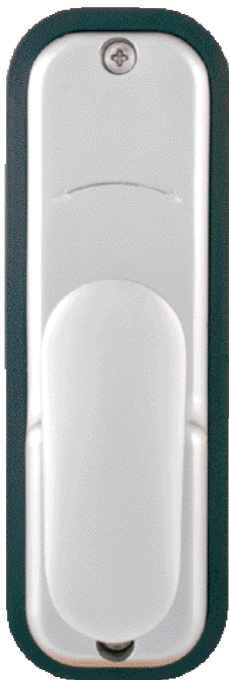
2000 SC Back