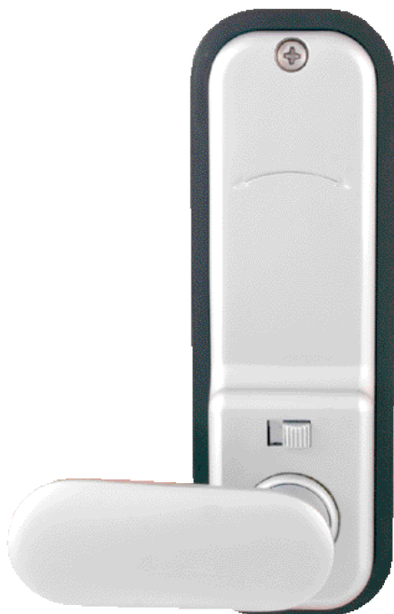
2200 Open Back

The BL2000 series is a range of fully mechanical pushbutton coded locks. The ergonomic design (originated by Borg, now imitated by many) and simple operating procedure ensures access for authorised personnel only.