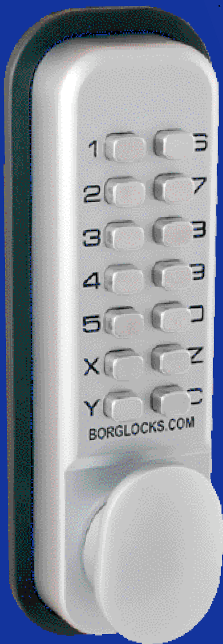
2000 SC Front